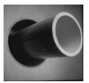
1. Center the pipe, cable or conduit in wall opening or casing. Make sure the pipe will be adequately supported on both ends. Link-Seal® modular seals are not intended to support the weight of the pipe.