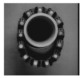
3. Check to be sure all bolt heads are facing the installer. Extra slack or sag is normal. Do <u>not</u> remove links if extra slack exists. Note: On smaller diameter pipe, links may need to be stretched.