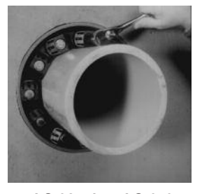
5a. LS-325 thru. LS-650 Using a hand socket or offset wrench ONLY, start at 12 O' Clock. Do not tighten any bolt more than 4 turns at a time. Continue in a clockwise manner until links have been uniformly compressed. (Approx. 2 or 3 rotations)