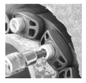
5. LS-200 thru. LS-315 Using a hand socket allen head or off-set wrench ONLY, start at 12 O' Clock. Do not tighten any bolt more than 4 turns at a time. Continue in a clockwise manner until links have been uniformly compressed. (Approx. 2 or 3 rotations)